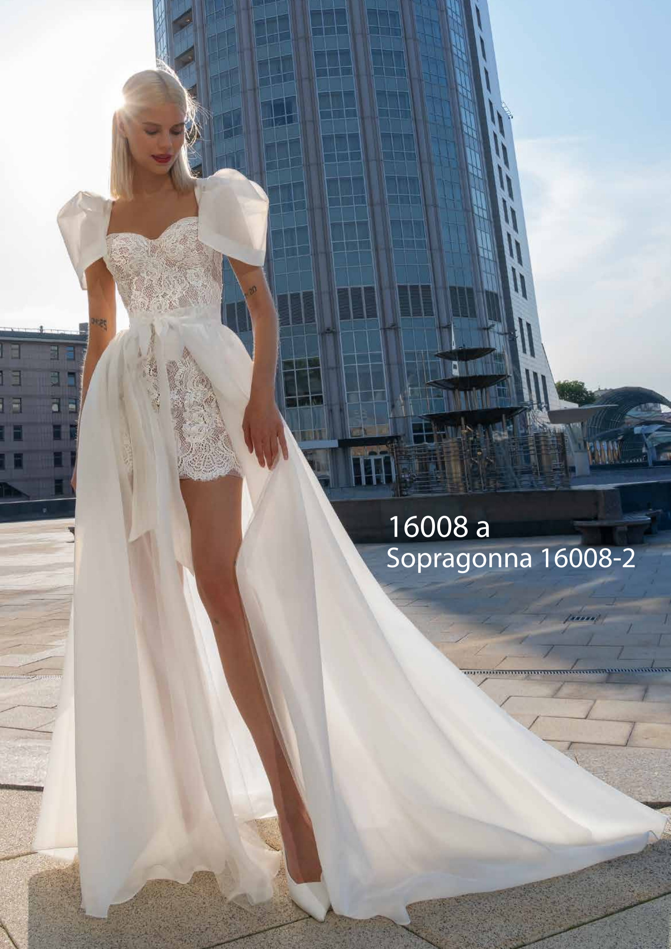
16008 a Sopragonna 16008-2