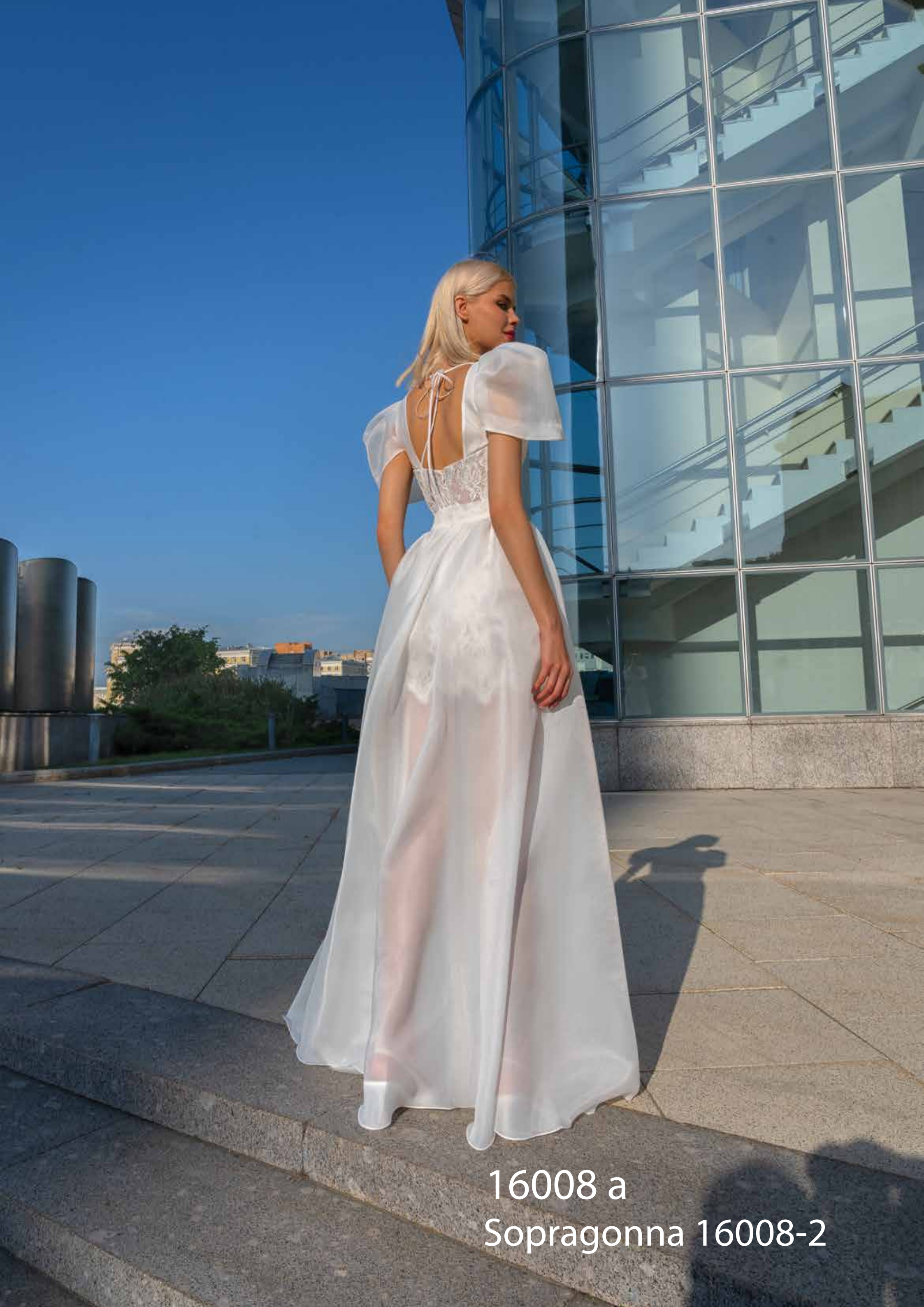
16008 a Sopragonna 16008-2