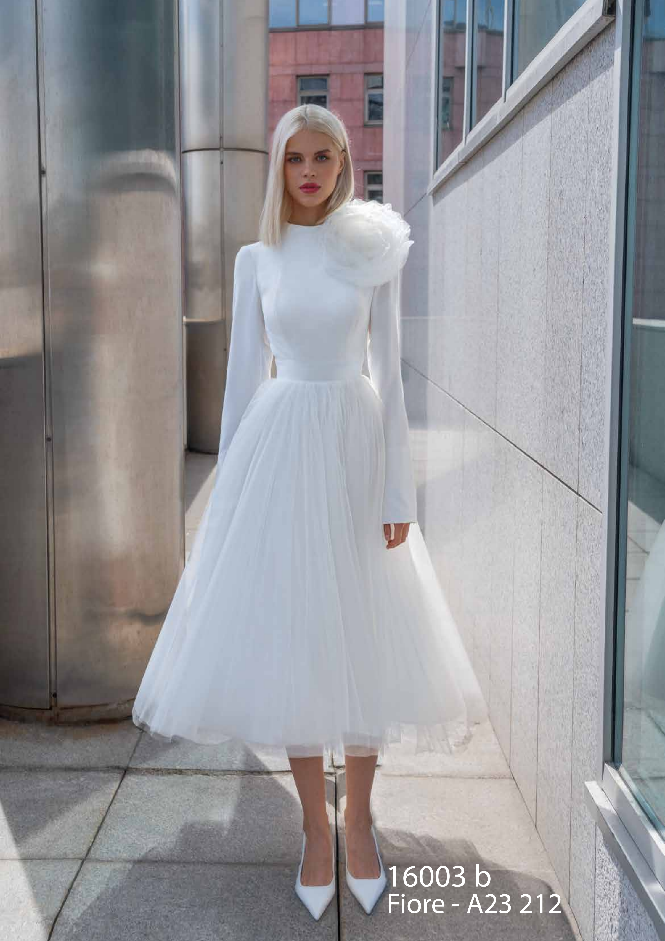
16003 b Fiore - A23 212